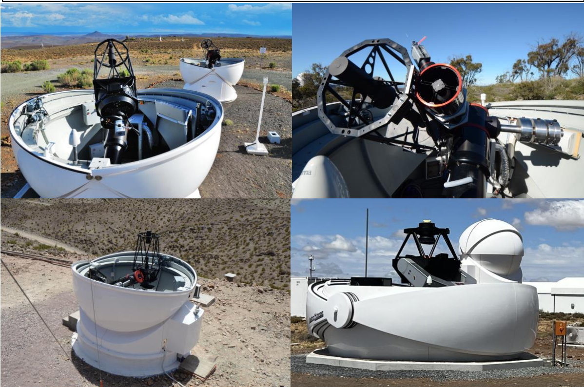
Solaris 1 and 2 (upper left, South African Astronomical Observatory, SAAO, Republic of South Africa), Solaris 3 (upper right, Siding Spring Observatory, SSO, Australia), Solaris 4 (lower left, Complejo Astronómico El Leoncito, CASLEO, Argentina) and Solaris 5 (lower right, SAAO)